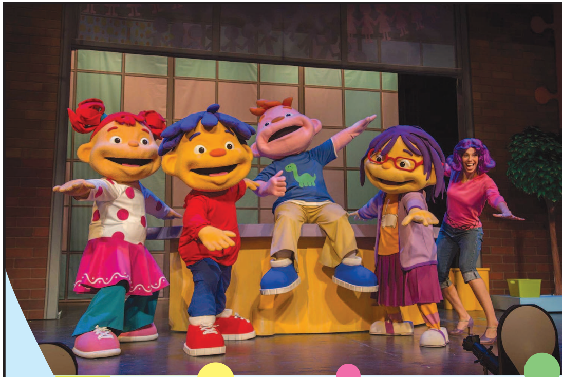
The cast of "Jim Henson's Sid the Science Kid Live: Let's Play!" will bring the PBS Kids television show to life with two shows Saturday at the Lake Michigan College Mendel Center Mainstage Theatre.