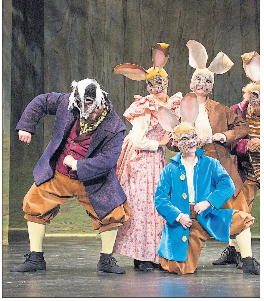
we were able to start the story in the ABOVE AND ON THE COVER: Enchantment Theatre Company presents "Peter Rabbit Tales" at 11 a.m. and 2 p.m. Theatre, 2755 E. Napier Ave., Benton Harbor.

are all grown up. Flopsy and Benjamin are married with bunnies of their own, and Mr. Bouncer, Benjamin cue them, and along the way, relive hedgehog, to help them find the bundirectors behind the Philadelphia- Bunny's father, has been babysitting their own childhood misadventures nies.