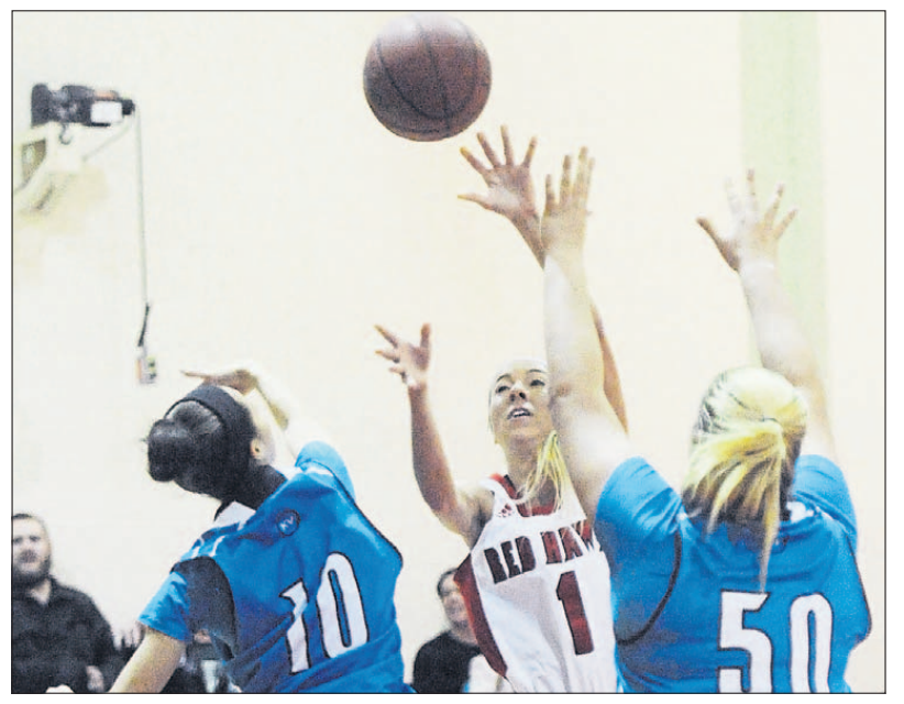
Don Campbell / HP staff See more photos:heraldpalladium.mvcapture.com

In the men's game, LMC (1-0, 4-8) led nearly the entire way, holding a 41-25