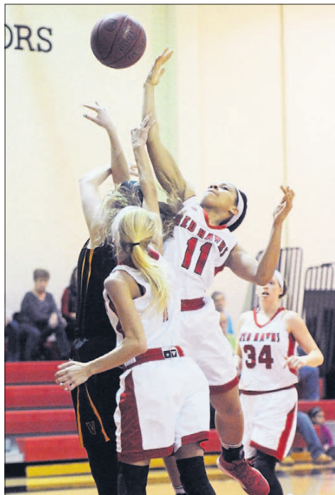
See more photos: heraldpalladium.mycapture.com

The Red Hawks (7-7 MCCA West, 10-15) used a fast-paced offense leading to a 52-41 halftime led over Glen Oaks (0-14, 0-20). Late in the second half the Red Hawks used a 19-8 run to put the game out of the Vikings' reach.